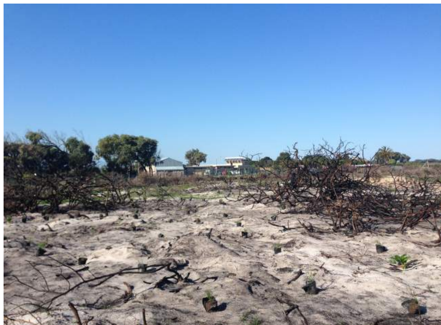
Planting of Thamnochortus erectus near the Peninsula road fence line.

Thank you to all who assisted with the planting at Rondevlei.