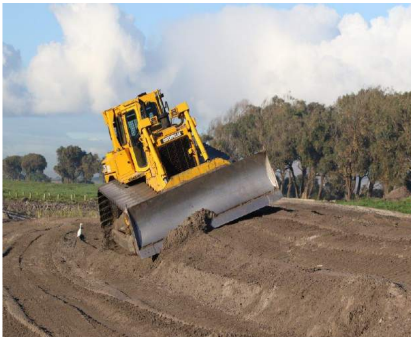
Earthworks