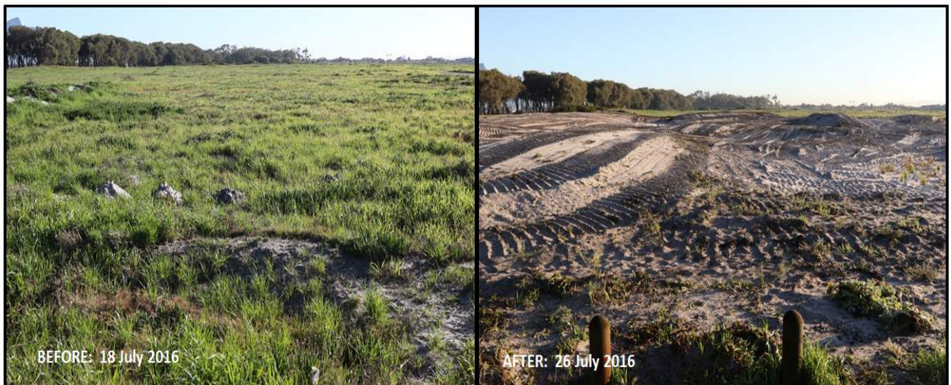
Before the commencement of earthworks on 18 July 2016, and after earthworks on 26 July 2016

The City of Cape Town: Environmental Resource Management Department in collaboration with TCT: Asset Management and Maintenance have implemented an ecological rehabilitation project on the Zeekoevlei Eastern Shore section of the False Bay Ecology Park (FBEP), to compliment the redevelopment of public facilities along this section. The Eastern Shore area has been subject to historic agricultural activities, which resulted in the degraded Cape Flats Dune Strandveld visible today. The primary project aim is to re-establish the historic endangered vegetation type, Cape Flats Dune Strandveld, and explore the possibilities of re-creating suitable habitat in the long term for key threatened species, such as the critically endangered butterfly, Barber's Cape Flats Ranger ( Kedestes barbarae bunta ), and the Endangered False Bay Unique Ranger butterfly ( Kedestes lenis lenis ). These two species only occur on the Cape Flats within the City of Cape Town, with the Barber's Cape Flats Ranger entire global distribution now restricted to only two remaining localities within the Cape Flats. The remaining habitats of both these butterfly species unfortunately still face on-going threats.