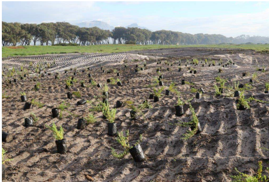
Placement of plants prior to planting