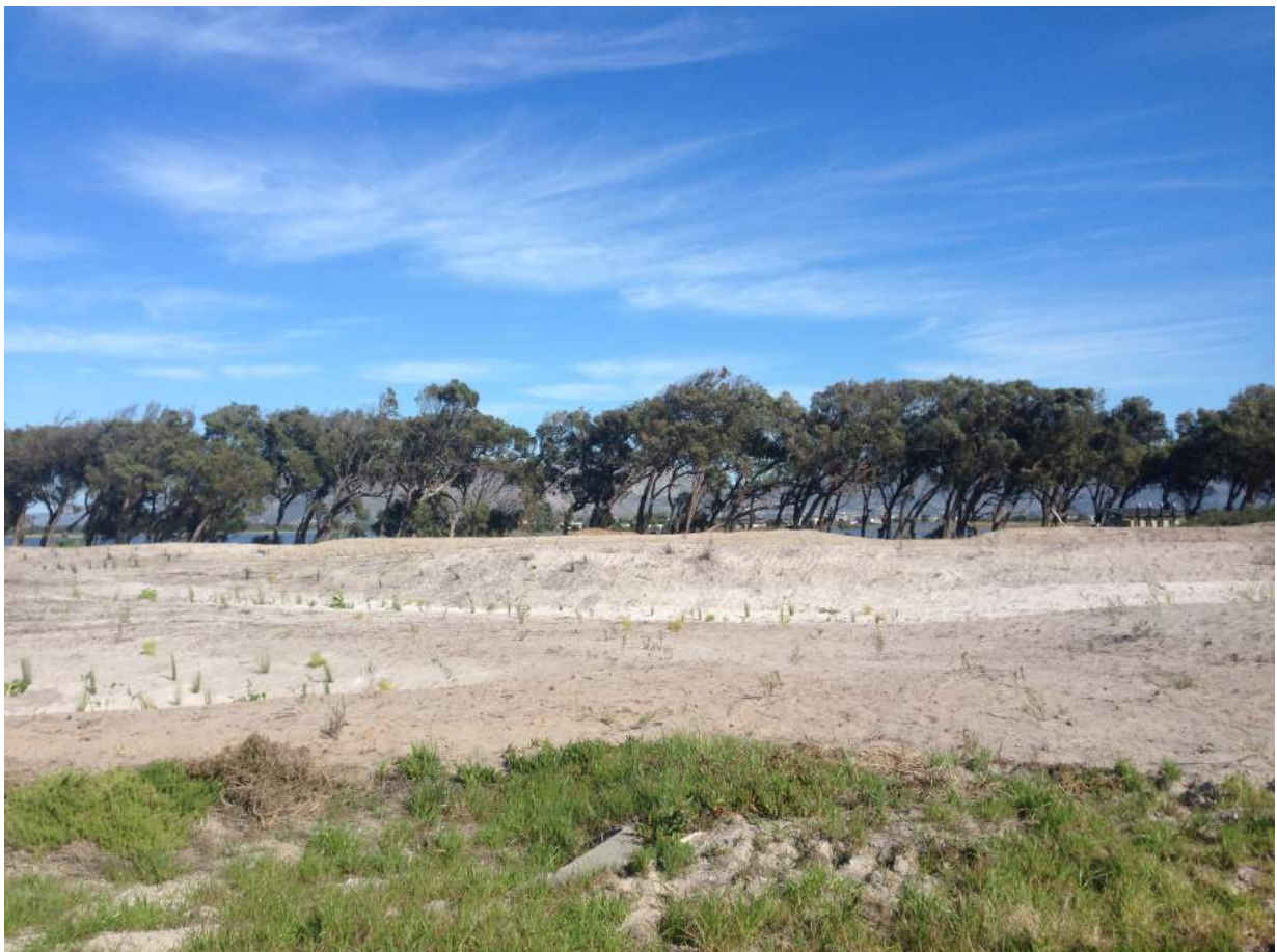
Rehabilitation site, 5 August 2016 (Photo: J. van Eeden, 2016).